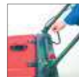
Lever for raising / lowering side brush.