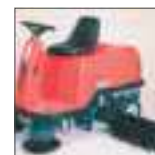
Easy to change the brushes