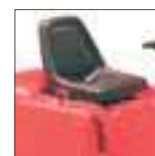
Adjustable ergonomic seat