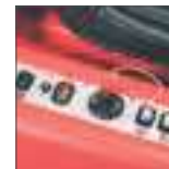
Clear and convenient operating console