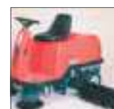
Easy to change the brushes