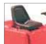
Adjustable ergonomic seat