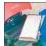
The filters can be changed without tools.