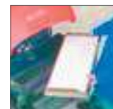
The filters can be changed without tools.