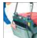
Easy removal of dirt container