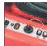
Clear and convenient operating console